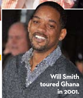
Will Smith toured Ghana in 2001.

W ill Smith turned the spotlight on this West African nation in 2001, while shooting Ali . He visited the slave castles (where captives were held before being sent to the New World) along the Cape Coast. Projects Abroad volunteers can either teach English (about 18 hours of conversation a week) to kids aged 8-14; work at an orphanage (occasionally, you'll take kids on field trips to the beach or to the Cape Coast Castle); or build homes in a local community. (Minimum volunteer time is two weeks; $2,345.)