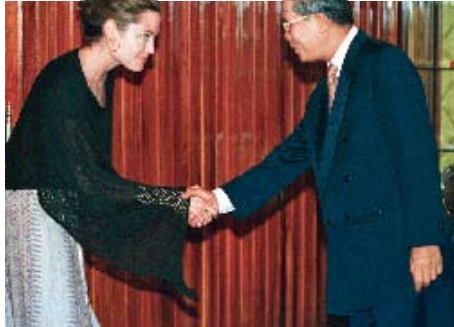
Angie (with Cambodia's prime minister, Hun Sen, in 2004) continues to help the poverty stricken in Cambodia through the Maddox Jolie-Pitt Foundation. She also has a home there (main).

A ngelina Jolie adopted son Maddox from this Southeast Asian country in 2002. Projects Abroad sends volunteers to orphanages in Siem Reap (close to Battambang, Maddox's home city) as well as in the capital, Phnom Penh. As a volunteer, you'll teach English, help with homework and play sports with the students after school. While there, enjoy trips to the temples around Angkor Wat and the floating villages on Tonle Sap Lake. (Minimum volunteer time is one month; $2,695.)