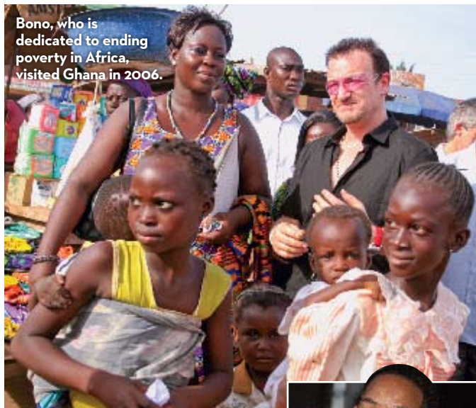
Bono, who is dedicated to ending poverty in Africa, visited Ghana in 2006.